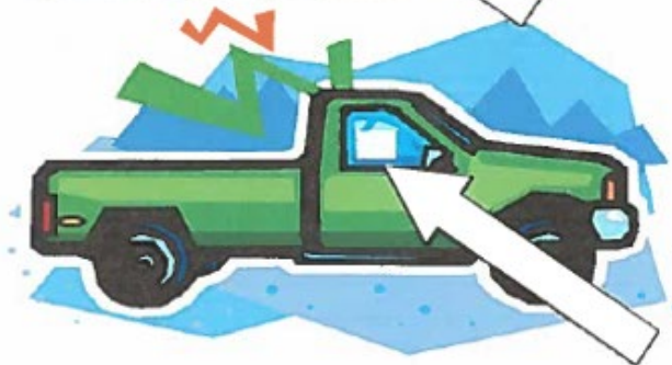
Right & Left Side Window